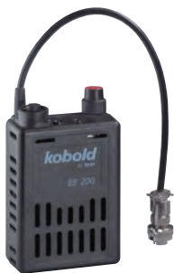
BB200/C with „Slide Lock-SL3“ coupler, with 2 pin S12-plug 742-0193