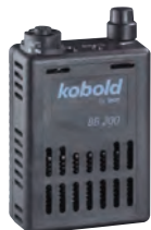
BB200/SL3 with „Slide Lock-SL3“ coupler 742-0195