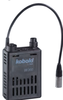
BB200/X with „Slide Lock-SL3“ coupler, with 4 pin XLR-plug 742-0191